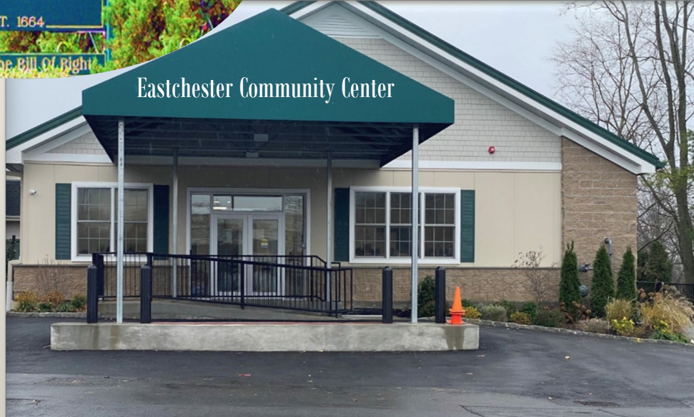
Eastchester Community Center